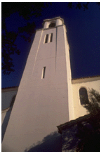
The Main Courthouse in Rivna where the LaCie embezzlement trial began today.

The trial of Morrow LaCie, financial advisor to Bishop Valla T. Merrin, begins today in Rivna. City Persecutors declare this to be an "open and shut" case. If convicted, he could face excommunication and a five year sentence in the Limitless Sky Salt Mine, where critics claim that "five years" is longer than "life".