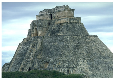
The once proud fortress of Guildmaster Ocher LaHay — now a burned-out wreck!

Day two of the LaCie trial opened with Persecutors grilling the embattled financial advisor's associates about their involvement in what is being dubbed the "Church of the Slumlord" scandal. "He told is that diverting the funds to offshore accounts was the Bishop's idea," said Kiran LaDin, junior financial advisor. "It's amazing how well he forged the Bishop's signature on the transfer documents. To an untrained eye, it would look just like the Bishop had signed them!" The Reverend Valla T. Merrin was present for this day's proceedings, but was not called to the stand.