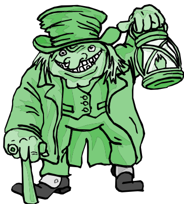
Paru, a port town already in chaos and turmoil, was attacked by putrid, shambling corpses last night!

from Chudra Blothan's pirate ship spontaneously reani-