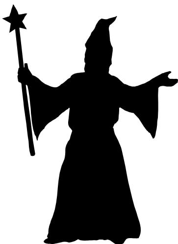
The shadowy, masked leader of the Calamarian Sisterhood promises violence and death for East Point cities tonight.

A full eclipse of the Watcher is expected just after midnight tonight. Port cities all over East Point are on high alert as they pre-