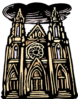
Illuthielite temples are often designed to be mockeries of True One Churches

A dark steeple has begun to emerge from the ground two miles north of Ex-Libris, and the vegetation around the eruption has withered.