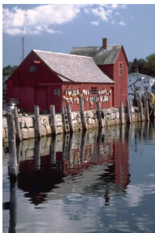
Awa'Laroo, a picturesque coastal village in East Point, pictured here before the Ports-bane Ritual that destroyed nearly every building in town.

The tiny coastal village of Awa'Laroo was decimated by the Undead plague sum-