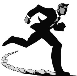
Know these criminals by their black suits and dark sunglasses

The Dealer offers lessons on Mondays and Tuesdays, as well as by appointment! Confidentiality is assured!!