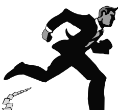
Well-dressed assassins... Where do they come from? What do they want?

The Madam Librarian, however, had a different opinion, saying "I like Valedictorian Park as-is."