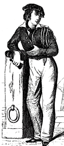
Captain Te Pi, sketched here back when he held the rank of Ensign, bravely fought the Calamarian terrorists, even at the cost of his life.

our combined might could never have sunk the six Calamarian cruisers."