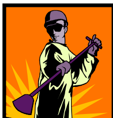
Masked Cultist demands appeasement and sacrifice for Sarcophka!

A Doomsday cult appears to be forming in the