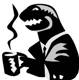
Perris: The most sharply-dressed supernatural killing machines one can ever illegally summon!

Demogorgon, two Perris, and an Unmasked Demon into the fray. These super-