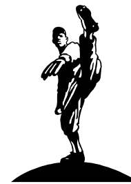
DeSoto: Vows to "Kick Butt"