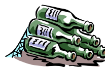
Coin Rattlin' Wraith: A good stiff drink, or a Scaxathromite joke?