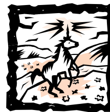
Dance of Many Horns: A Dommalon Tradition!

"I don't know why they didn't clear it with me," Madame Librarian said, "but we wish them well."