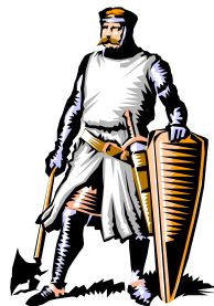
Mikal Hellion: Another victory won for the forces of Good!

Even with most of the Clan Armies decimated by "lord" Orloc's Undead militia, the final defenses of