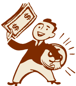
Easy Credit! Your soul is the only collateral!

The immortal, known only as the Banker, announced today that his firm will be happy to loan money to the victims of the Calamarian terrorist attacks.