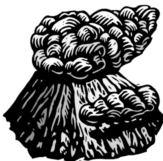
The Limitless Sky Salt Mine. For prisoners, a "life" sentence is usually less than five years!

Because of Merrin's revealed nature as a powerful telepath, he was sentenced to fifteen years of solitary