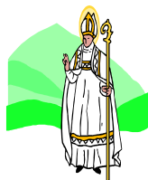
Bishop Thistle Brae: Merrin's Guilt a sad day for the Faith. He is also heading the Search committee for Merrin's replacement.

In breaking news, the Bishop of Rivna, Valla T. Merrin, was found guilty today of several counts of embezzling church funds, extortion, and the misuse of empathic powers in the commission of crimes.