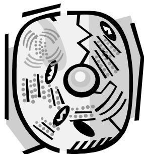
Historical record image of the Hemophage-III virus, which kills by dissolving the cell membranes, causing its victims to "melt".

While speculation about today's catastrophe in Midian has not been substantiated, it does appear that the besieged South Point city was decimated by an act of