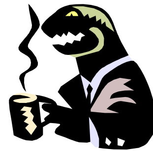
Signboard for Count Ptophi Coffee.

The Great Library is pleased to announce that it has granted license to Count Aratesh Petophi