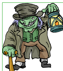
Zombies as the new "Hired Help"

The Banker, East Point's money-lending Immortal, announced today that he is launching a new temporary labour service,