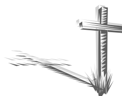
Protector's Emblem from Construct Frank's shield.

"Frank was the only choice," said Bishop Chalkminer of Rivna. "He's the only Construct