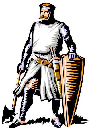
Mikal Hellion, War Leader of West Point. Is he the Matron's last, best hope for peace?

"We're making progress," War Leader Mikal Hellion declared. "The Matron's spearmen also fight with a bravery I have seen matched only