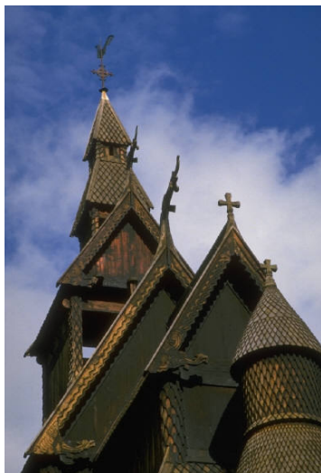
A front view of Bishop Merrin's stately rectory. A tintype of his summer palace was not available at press time.

Bishop Valla T. Merrin of Rivna decries the foul murder of the Gazette editor who brought to light the accusations of his financial infidelity. "I and my Law Twisters welcome this investigation into my financial practices," he said via written statement from his legal advisors from the Offices of Hand and Book. "I have every confidence that it shall be found out that another is guilty of what I am accused of," he added.